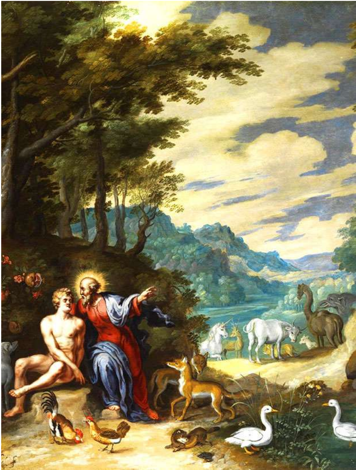
(Artist: Jan Brueghel Date: 1601-78)