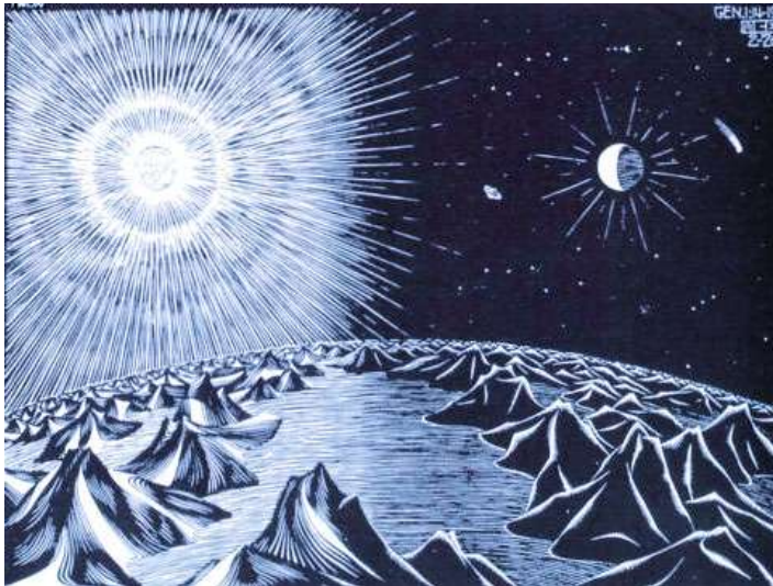
(Artist: M.C. Escher Date: 1926)

I offer to the mortals a change to search the chalice of supreme bliss.