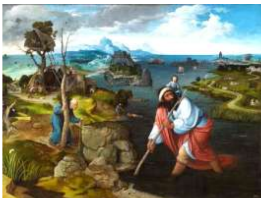
(Artist: Joachim Patinir Date: 1520)

There is no one except him to drown your soul in grace. Be sure there is no better and ardent lover than him.